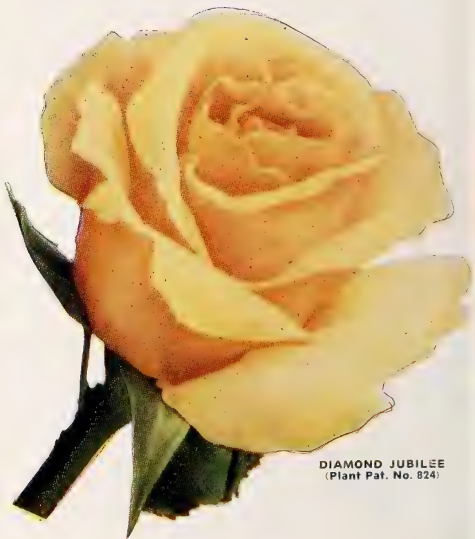
DIAMOND JUBILEE (Plant Pat. No. 824)